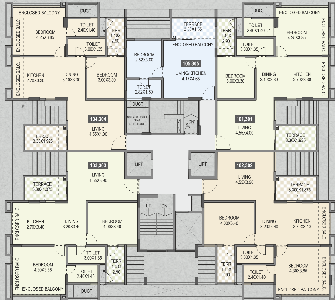
Area Statement as per MAHA RERA