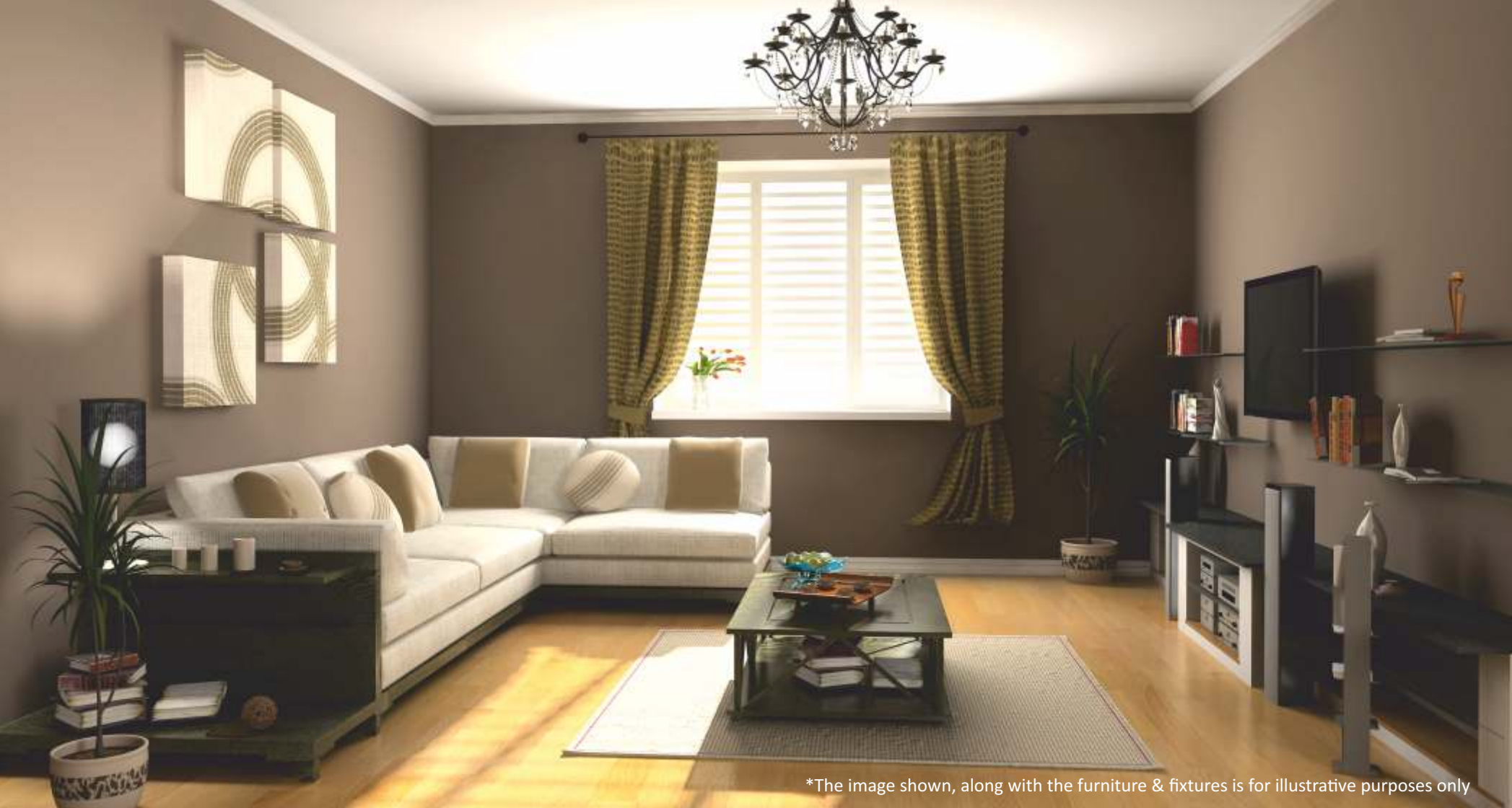
*The image shown, along with the furniture & fixtures is for illustrative purposes only