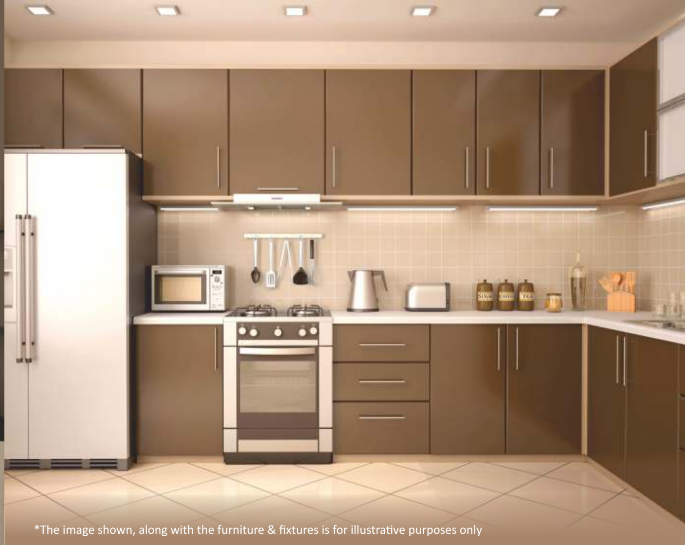
*The image shown, along with the furniture & fixtures is for illustrative purposes only