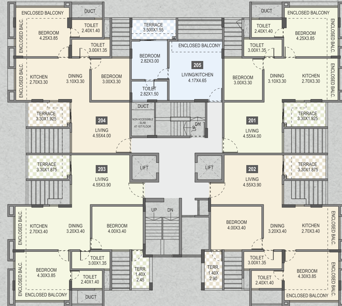
Area Statement as per MAHA RERA